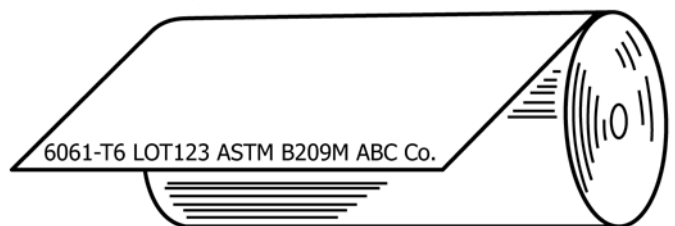
FIG. 1 M Spot Marking for Coiled Sheet